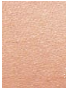
Simpson on skin colour swatch

You'll notice the new packaging too. When you purchase three SIMPSON eyeshadows with your first order, you will receive a SIMPSON refill free. SIMPSON , the colour of warm red gum honey.